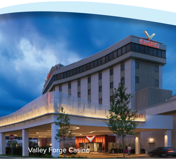
Valley Forge Casino