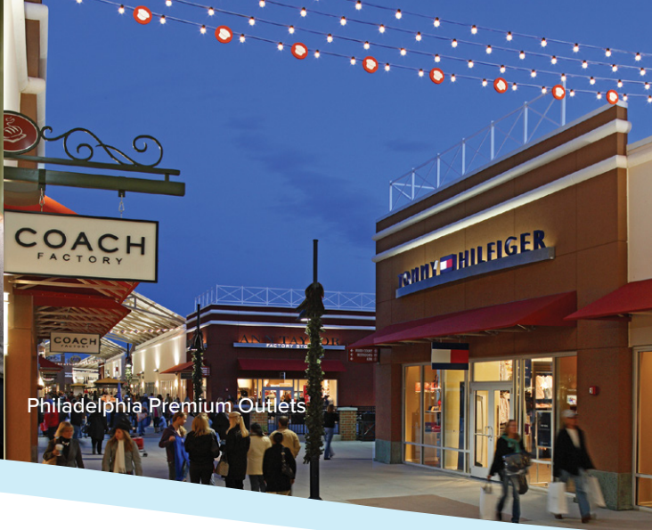
Philadelphia Premium Outlets