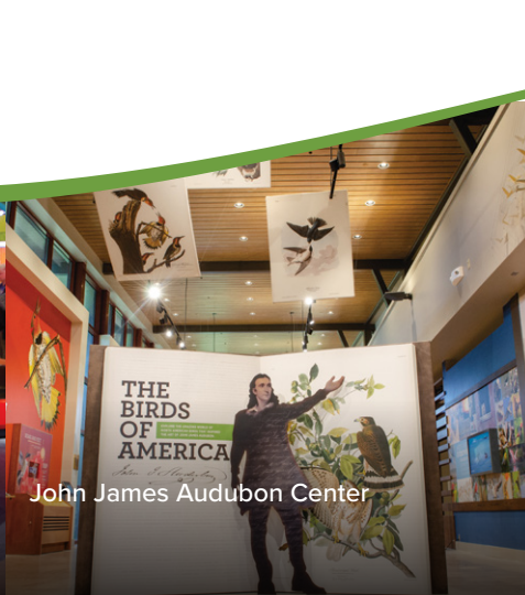
John James Audubon Center