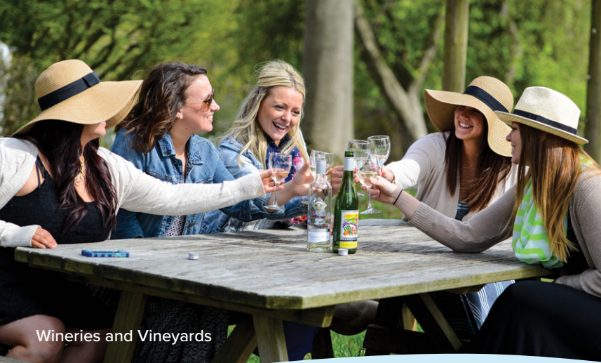
Wineries and Vineyards