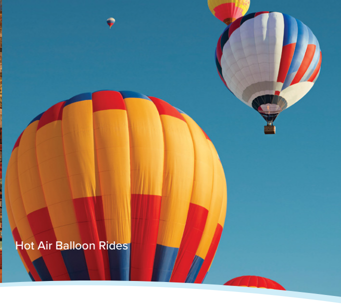
Hot Air Balloon Rides