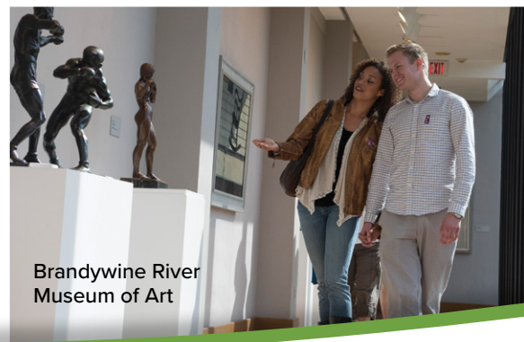
Brandywine River Museum of Art

Just beyond the bustle of the city, around the curve of the river and into lush rolling hills, lies The Countryside of Philadelphia.