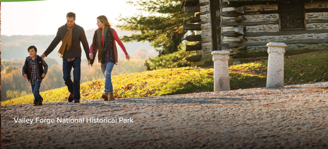
Valley Forge National Historical Park