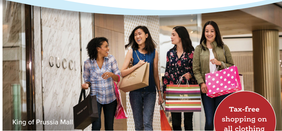
King of Prussia Mall

Tax-free shopping on all clothing & shoes