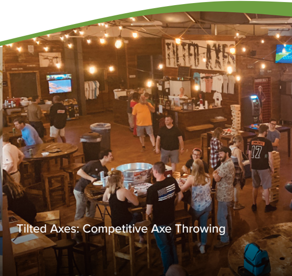
Tilted Axes: Competitive Axe Throwing