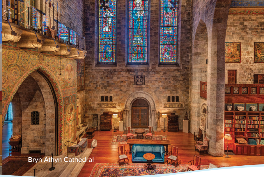
Bryn Athyn Cathedral